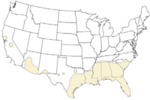
Approximate distribution of Aedes aegypti in the United States*