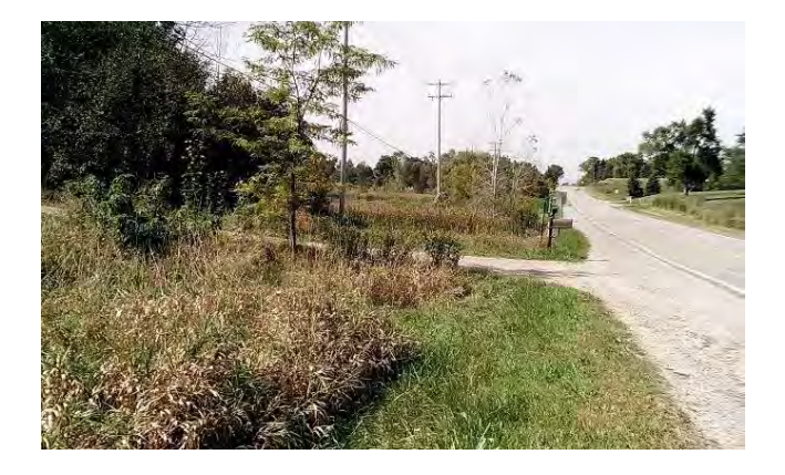
Iron Belle Trail; Gale Road Section Atlas Township, Genesee County, Michigan

OHM Advisors was awarded the design and construction engineering for the Iron Belle Trail: Gale Road Section in Atlas Township for the Genesee County Parks and Recreation Commission, in cooperation with the Genesee County Metropolitan Planning Commission and the Genesee County Road Commission.