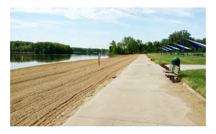
Blue Bell Beach Accessibility Project Genesee Township, Genesee County, Michigan

OHM Advisors is currently working on providing landscape and engineering plans that provide accessible pathways from the park's parking lots to the beach including beach accessible mats, making the water available to all guests.