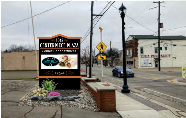
* Landscaping By Others, Conceptual Only