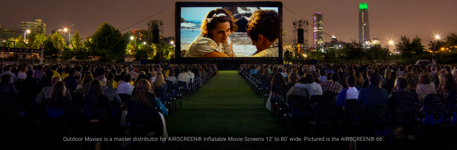
Outdoor Movies is a master distributor for AIRSCREEN® Inflatable Movie Screens 12' to 80' wide. Pictured is the AIRSCREEN® 66'.